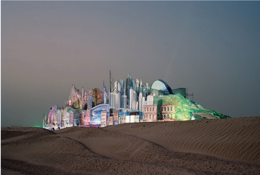
Florian Joy, Bawadi , 2006. From the 2015 Graham Foundation Organizational Grant to Columbia College Chicago-Museum of Contemporary Photography for the exhibition Grace of Intention: Photography, Architecture, and the Monument .

Over $496,000 awarded to 49 groundbreaking architecture projects around the world.